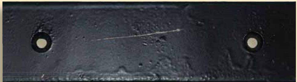
Close up of Deliberate Scratch shows little rust, no rust migration, and no detachment of the surface coating