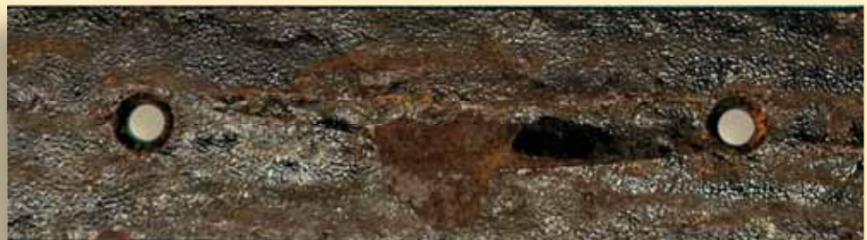
Close up of Deliberate Scratch shows excessive rust, dramatic rust migration, and advanced detachment of the surface coating

"When Quality Counts, count on Snug Cottage Hardware"