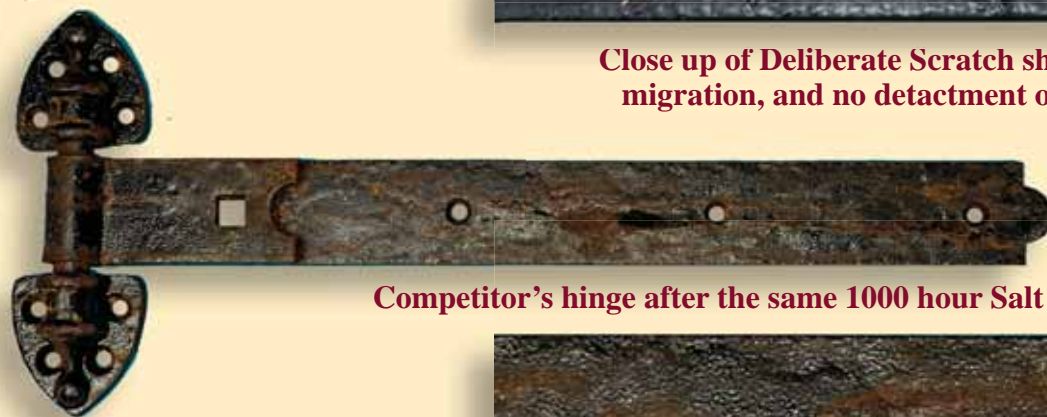
Competitor's hinge after the same 1000 hour Salt Spray Test